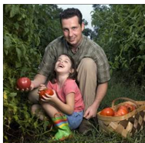
Community Wellness Emphasis to Eat Smart and Move More

You won't be a stranger for long in our community. We welcome new-comers with open arms. Our temperate climate means mild winters with a little snow for effect, but also a long gardening season complimented by the changing seasons and their colors. We are within easy access of major metropolitan centers as well as mountain retreat villages and offer a pleasant suburban lifestyle. Our excellent public school system (K-12) plus the community college and technical institute and Appalachian State University make education a valued commodity. The arts and culture are alive and well. Local and touring talent keep us entertained in both grand and down-home comfortable style. The great outdoors are just outside our door. Hiking, biking, kayaking, fly fishing, golf, tennis, skiing, horse-back riding and mountain climbing are just some of the things to keep you busy here.