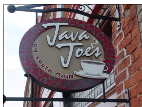
Signs of Downtown Revitalization

The views are spectacular; the coffee is piping hot; the community is generous in its support; the golf courses are inviting; the location is central to the mountains and a half-day drive to the beaches of the Atlantic; and the hospital is staffed by a collegial medical staff that needs your services to continue our pace of growth.