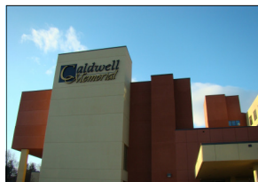
Caldwell Memorial Hospital 321 Mulberry Street SW Lenoir, NC 28645

All seven of our PCP groups are very busy. Caldwell Physicians is a network of hospital-managed practices that offers a growth opportunity. The ratio of PCPs to population is low and demand is high. Our experience in hospital-based provider practice management stretches over two decades. The position features the benefits afforded a hospital-employed physician with rewards that recognize individual productivity. The staff and administration of the our practices are well-trained and seasoned. There is a larger than expected group of specialists to serve our community and, in many specialties, we are the referral hospital of choice. If you would like to establish a practice in a community that will be welcoming and be part of a collegial medical staff, this could be right for you!